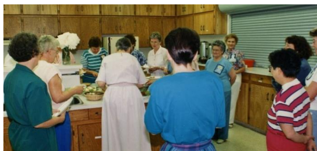
St. John's Lutheran Church