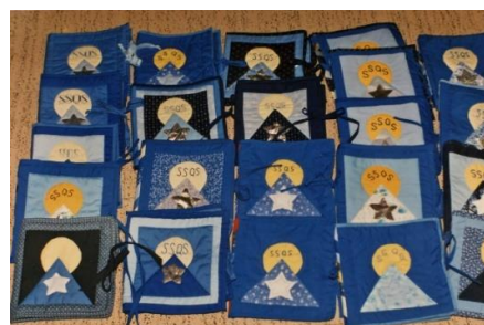
St. John's Lutheran Church