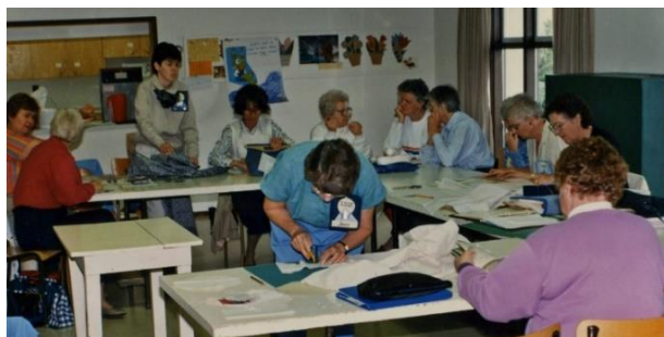
First Baptist Church